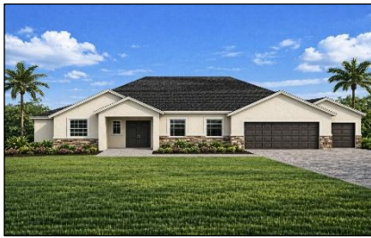
KATIE MODEL ELEVATION

KATIE MODEL US MILITARY & VETERANS 10618 Lighterwood Lane Ft Pierce, Florida. 34945 2238 Sq.ft, AC, 3447 Total 3 bd 2.5 bath 3 car garage